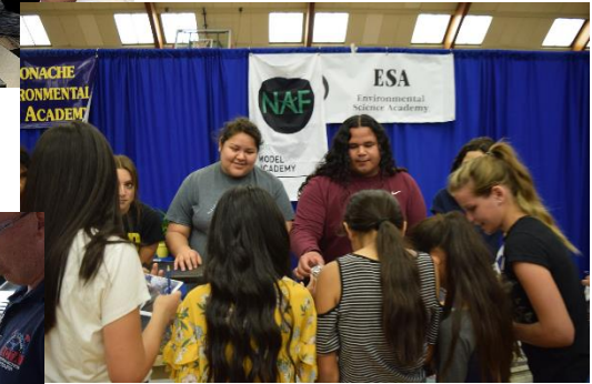
Table Topic Conversations